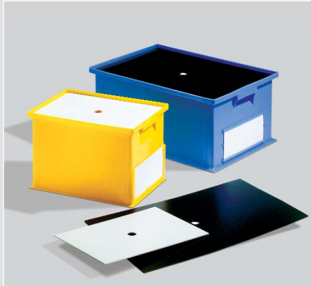
Lid with Finger Hole