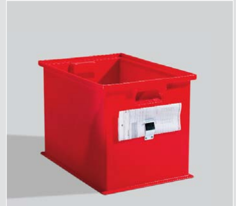
Clip to Hold Orders