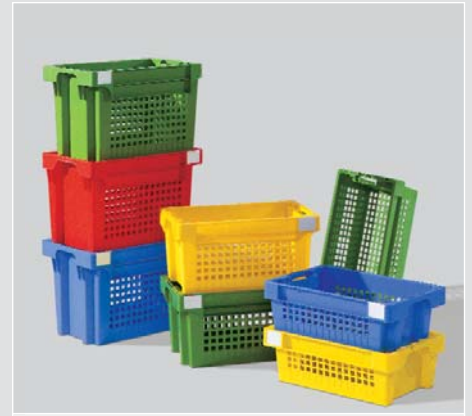
EFB with Mesh Sides