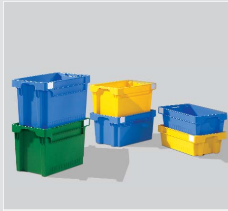
EFB with Solid Sides