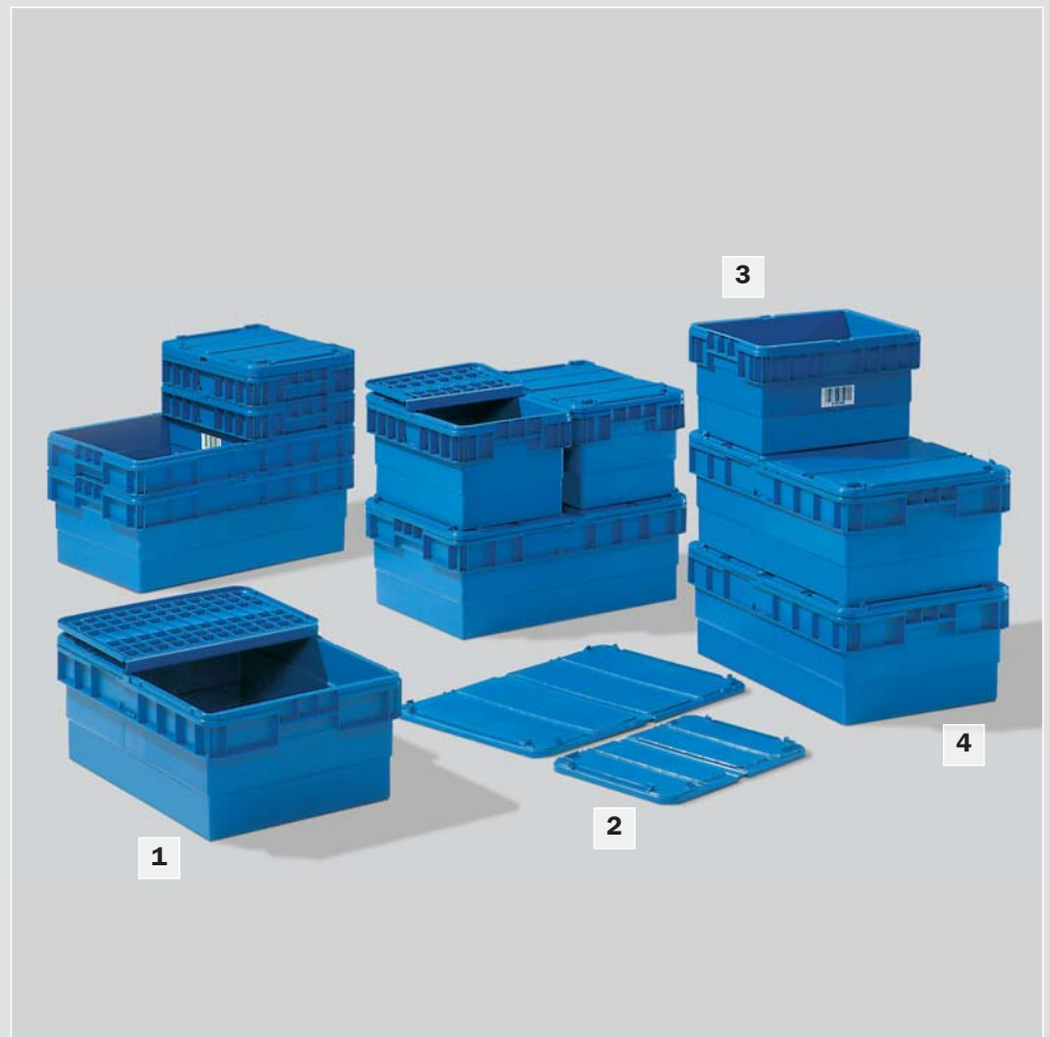
1 KSD 2416