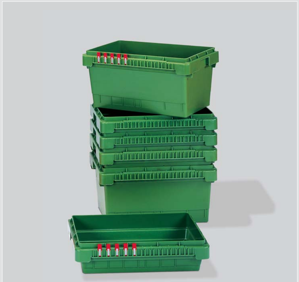
“C” Option for KS 201405 & KS 201410