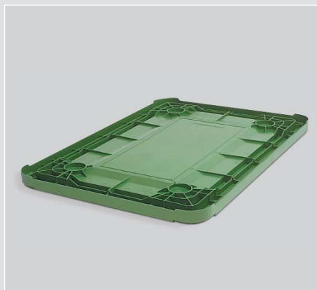
Lid for KS 302112