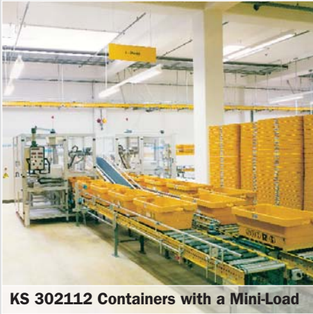
KS 302112 Containers with a Mini-Load

The KS drafted wall containers nest when empty and stack when used with a lid. Many are suitable for use on a Euro-pallet or 48" x 40" pallet. Some have unique features like water-resistant seals, automated lifting or positioning features, or nestable lids.