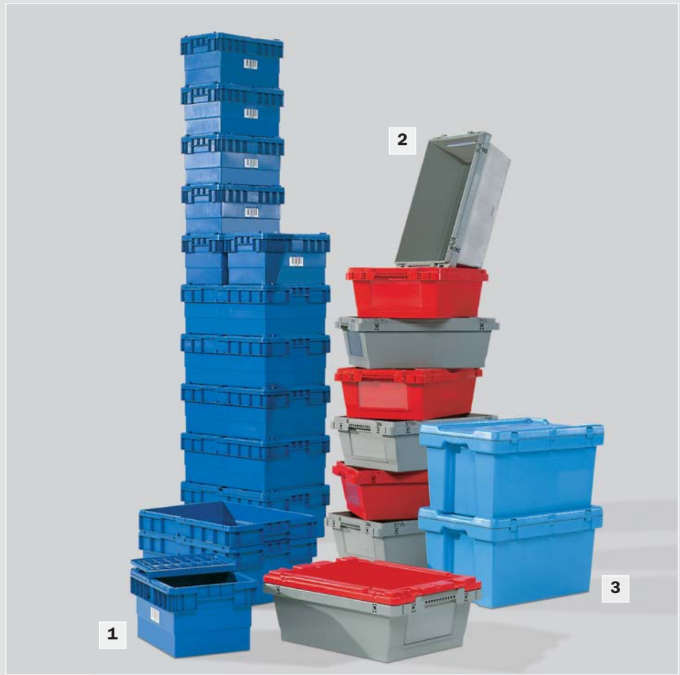
1 KS 241608