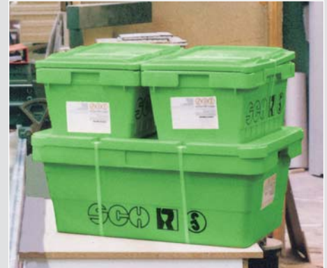
KS 302112 Container with Lid & Two KS 201410 Containers on Top