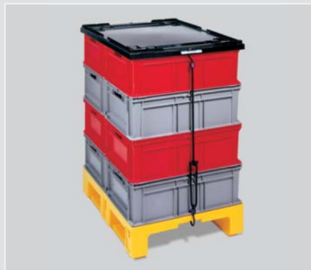
EDF 3224.2SBBK1: Bungee Cord Secures Lid to LTPS 815 Pallet

The LTS pallet is made of polypropylene and is compatible with the MF, LTF, LTS, KLT and EF container lines. The longitudinal runners make the LTS pallet ideal for use with roller tracks, link conveyors, lifting platforms, etc. The raised periphery lip retains loads securely and the 4-way fork entry allows for easy handling and positioning.