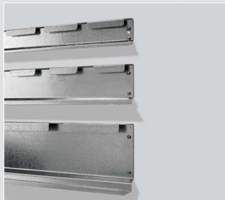
Wall-Mounted Panels - FEL