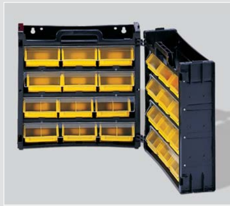
Porta-Fix - PF 6